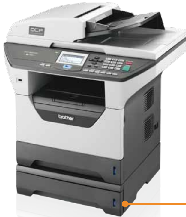
DCP-8085DN (WITH OPTIONAL LOWER TRAY LT-5300)

with colour scanning direct to any network location or FTP site